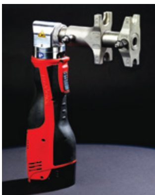
Axial Pressing Tool AAP102