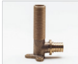
Male Lugged Elbow