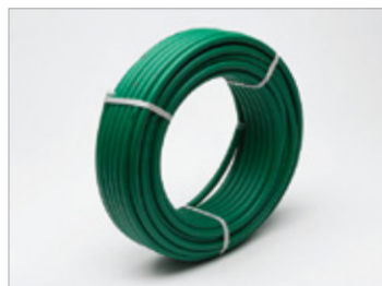
Green - Water Pipe Coil