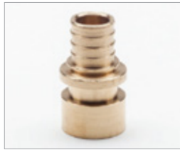
Copper Brazing Tail