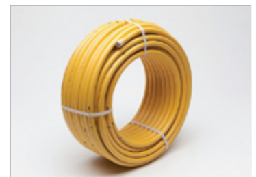
Yellow - Gas Pipe Coil