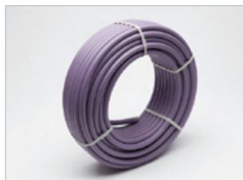
Lilac - Water Pipe Coil