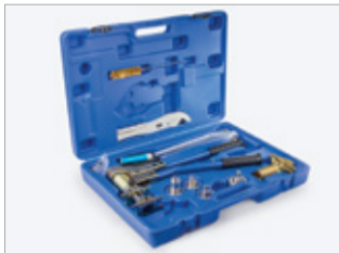
Veltanium Tool Kit