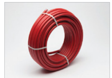
Red - Water Pipe Coil