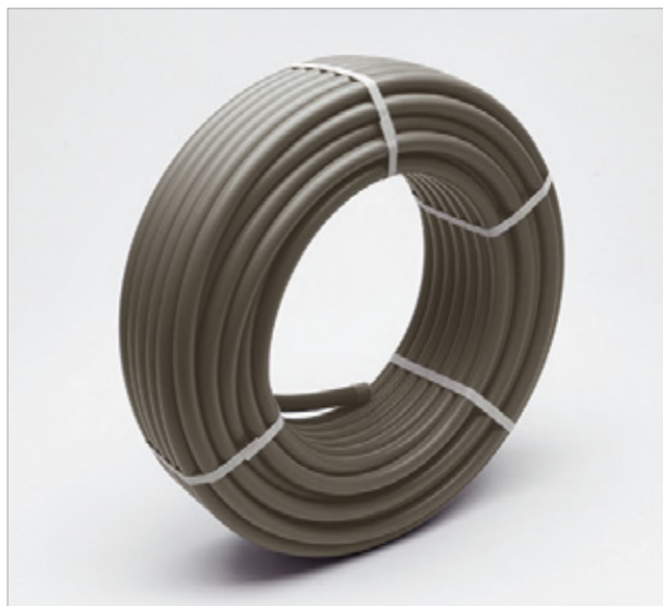
Titanium - Water Pipe Coil

VELTANIUM compression piping comes in a range of colours, to define needs, with our signature titanium pipe being the choice for hot and cold water.