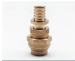
Copper Flared Adapter

VELTANIUM connection fittings are formed from the highest quality brass, for systems 16-32 mm. Materials remain the superior choice for the most failsafe, high-performance system.