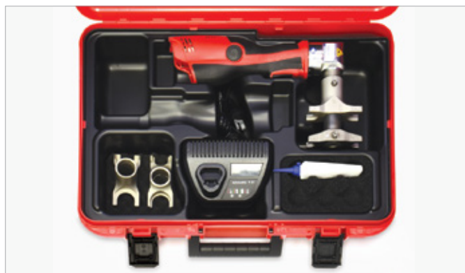
Veltanium Tool Kit 16-32